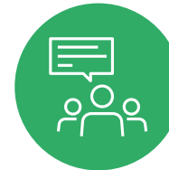
MENTORING & DEVELOPEMENT