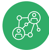
GLOBAL GRADUATE NETWORK